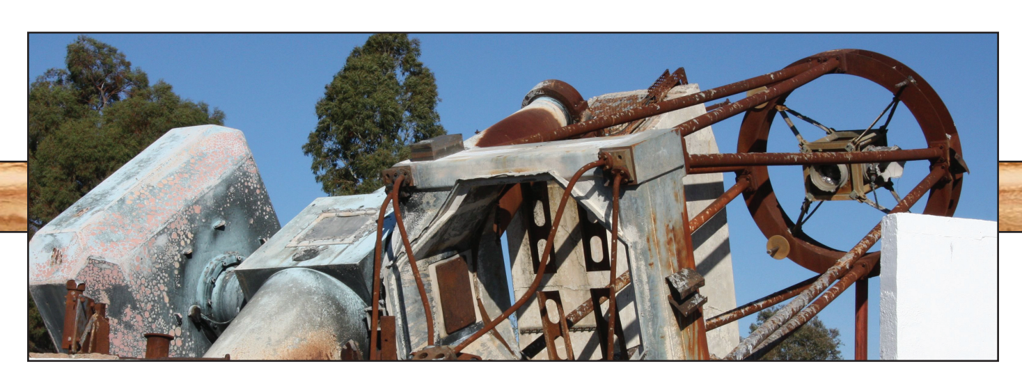
The damaged GMT at Mt. Stromlo. Note the absence of the dome.